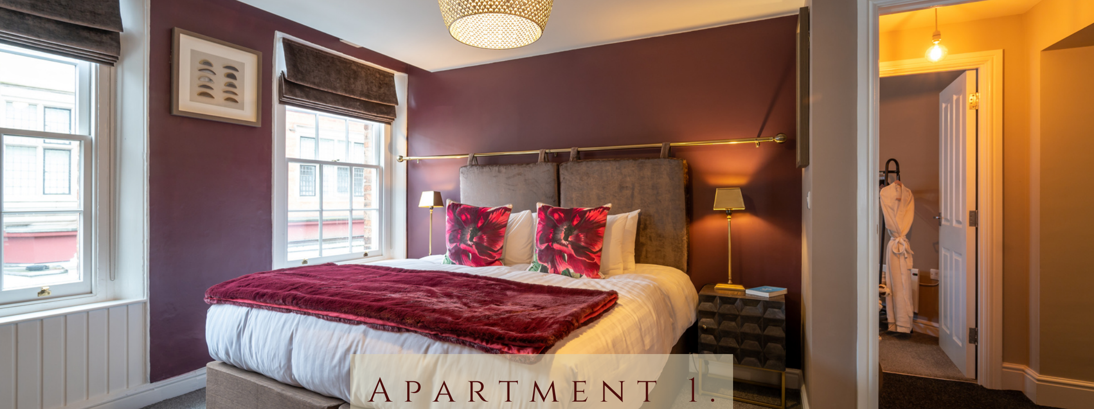
APARTMENT 1. BEDROOM 1 SUPER KING BED OR TWIN