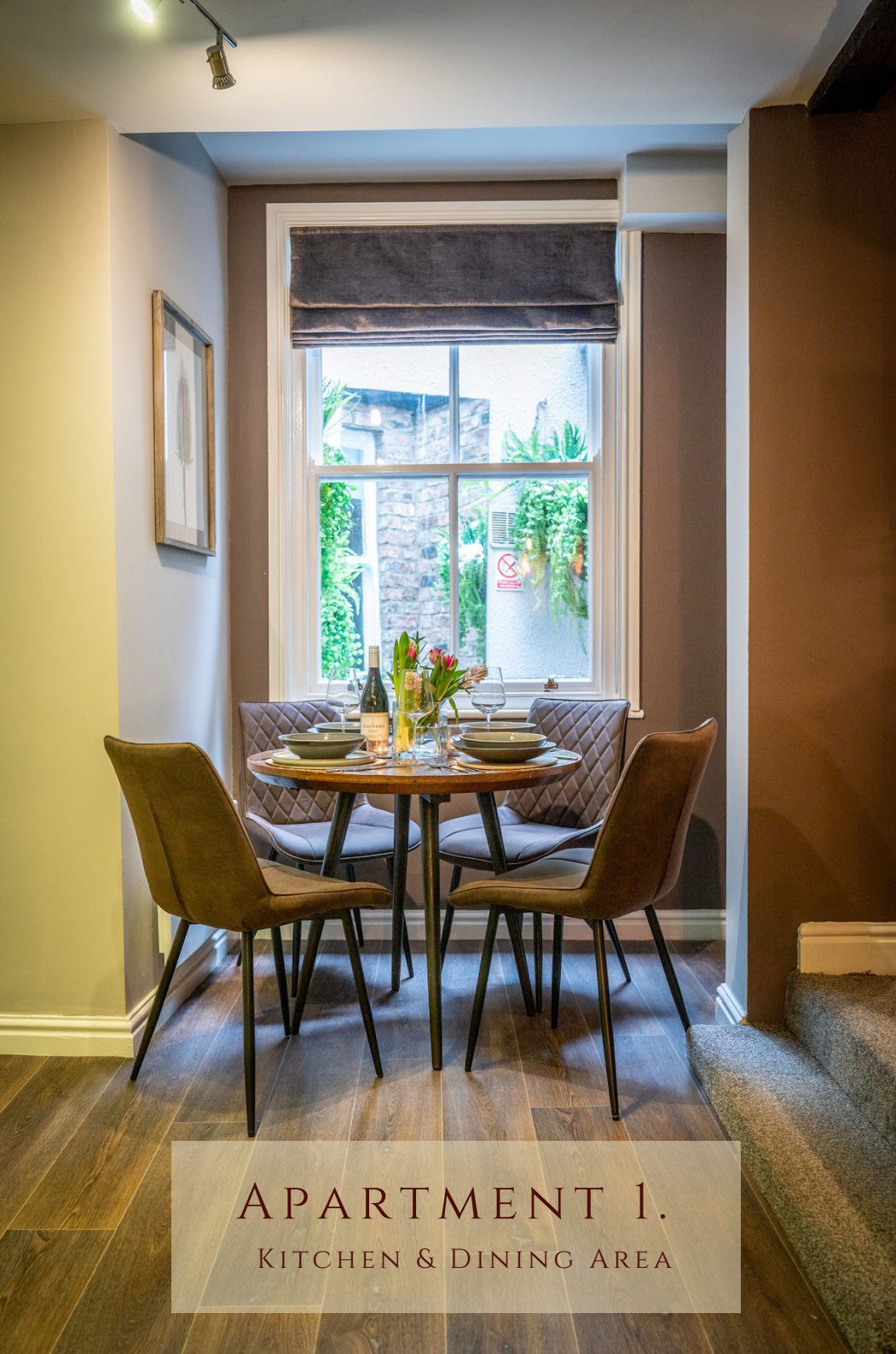
APARTMENT 1. KITCHEN & DINING AREA